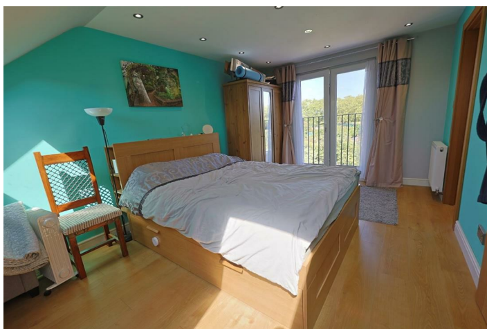
Bedroom One 18'1 (max) x 10'5 (max) (5.51m (max) x 3.18m (max))