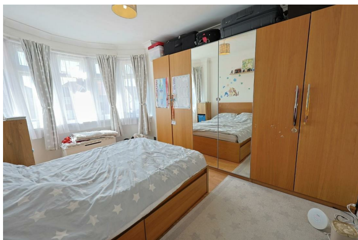
Bedroom Three 13'7 (into bay) x 10'7 (4.14m (into bay) x 3.23m)